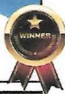
Saksham Anand 92.8%